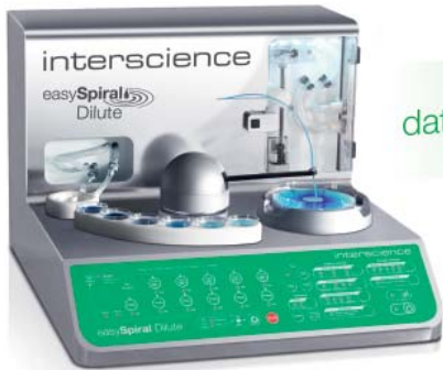
easy Spiral Dilute® serial dilutor and automatic plater