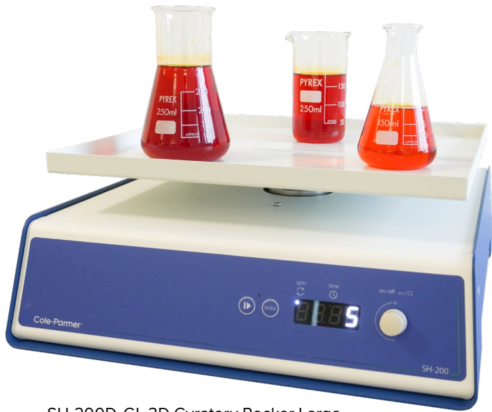
SH-200D-GL 3D Gyrotory Rocker Large